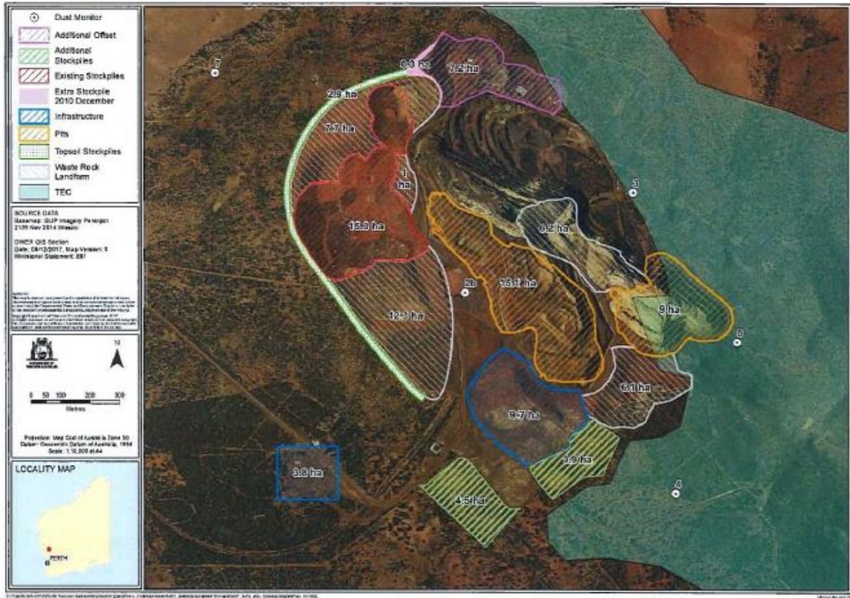
Figure 1: Koolanooka Mine Site Layout

SMC suspended Blue Hills operations in May 2015, pending approvals for an expansion of operations. Operations have since resumed on December 2020. Areas not planned to be reused for future mining have been rehabilitated.