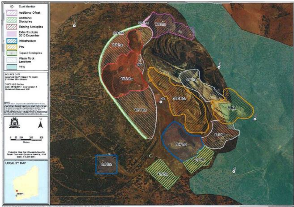
Figure 1: Koolanooka Mine Site Layout

SMC suspended Blue Hills operations in May 2015, pending approvals for an expansion of operations. Operations resumed in December 2020 and were placed in care and maintenance in September 2021. Mining recommenced for a short period from July 2022 to October 2022. The Blue Hills operation is currently in operation after recommencing in March 2023. Areas not planned to be reused for future mining have been rehabilitated.