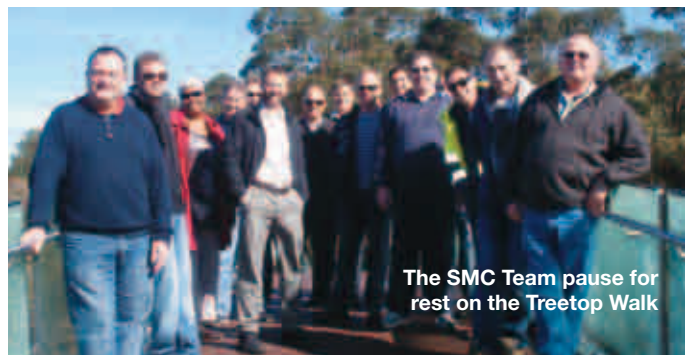
The SMC Team pause for rest on the Treetop Walk

We're getting hungry just thinking about next year's NAIDOC Week!